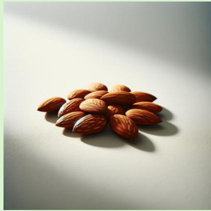
Snack: Small handful of almonds