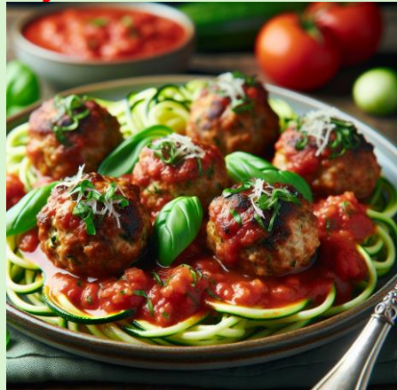
Dinner: Turkey meatballs with zucchini noodles & marinara sauce