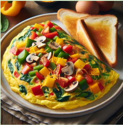
Breakfast: Veggie omelet with toast