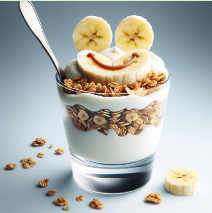
Breakfast: Greek yogurt with granola & banana