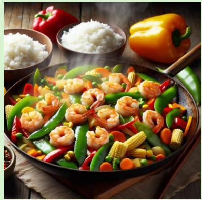
Dinner: Stir-fried shrimp with brown rice & veggies