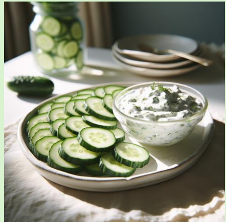
Snack: Cucumber slices with tzatziki dip