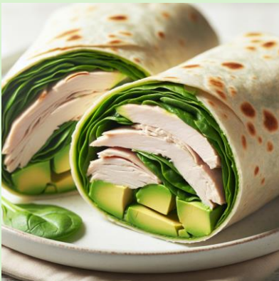
Lunch: Turkey wrap with spinach & avocado