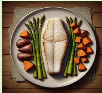
Dinner: Baked cod with sweet potato & asparagus