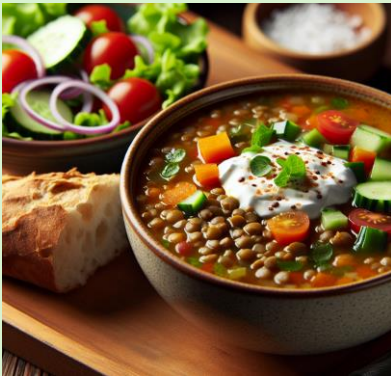
Lunch: Lentil soup with side salad