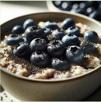
Breakfast: Oatmeal with chia seeds & blueberries