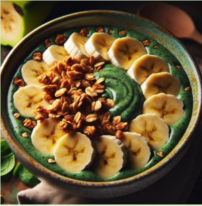
Breakfast: Smoothie bowl with spinach, banana, protein powder