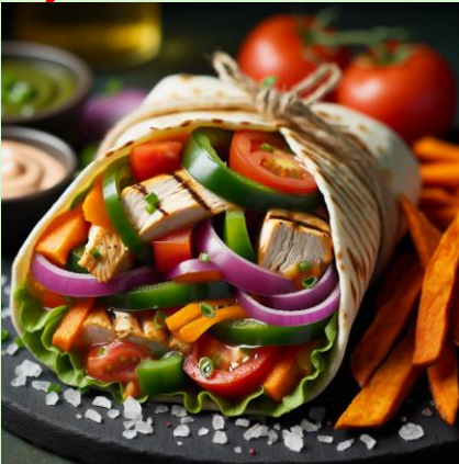
Lunch: Grilled veggie & chicken wrap