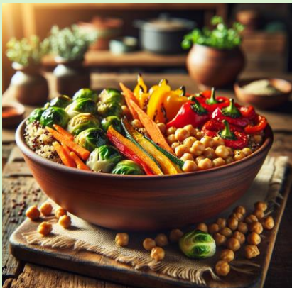
Lunch: Quinoa bowl with roasted veggies & chickpeas