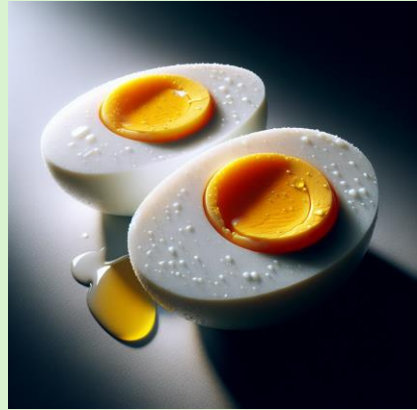
Snack: Hard-boiled eggs