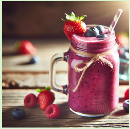
Snack: Protein smoothie (berries + almond milk)

Strong start—protein and fiber for lasting energy